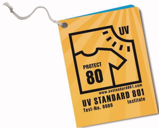
Category „Shading material“